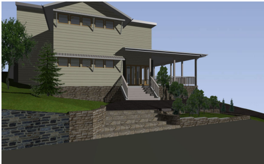
Standing from car park