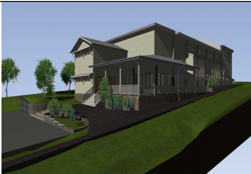
Artist Impression courtesy of Norman Richards Design